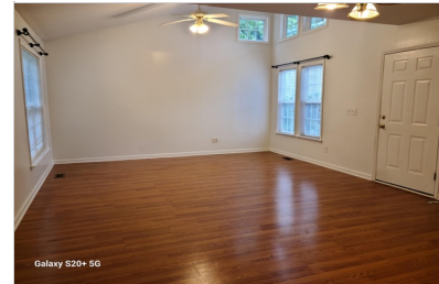
Galaxy S20+ 5G