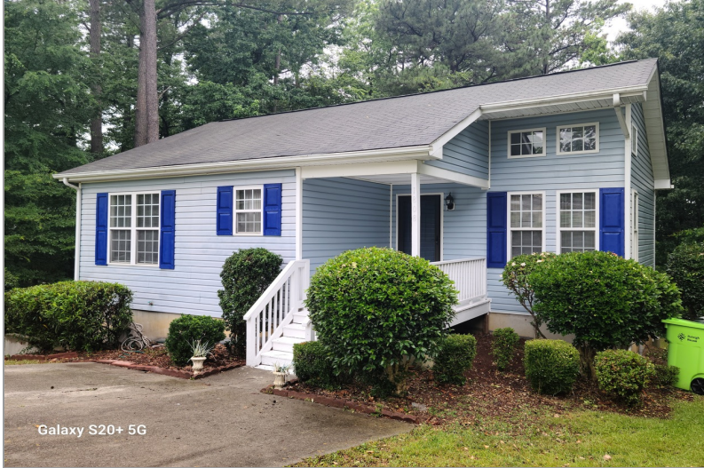
Galaxy S20+ 5G