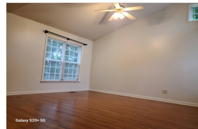
Galaxy S20+ 5G