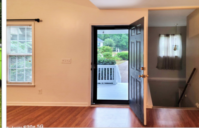
Galaxy S20+ 5G